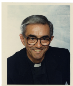
Portrait from the 1992 Archdiocesan Directory